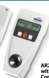
AR200/TS METER-D with Optional Communications Cradle