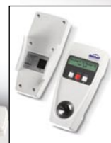
TS Meter-D Refractometer with optional IR Communication Package allows for Reading Log, Calibration Log, and Custom Scale transfer to any PC.